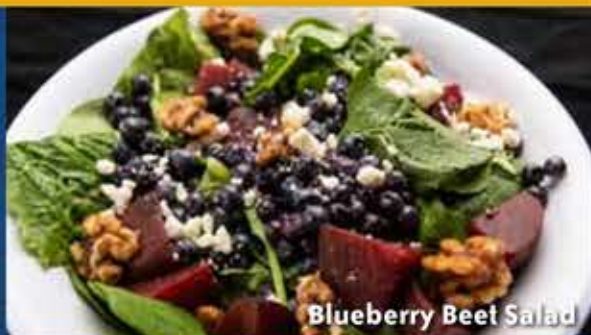
Blueberry Beet Salad

We've been busy creating new salads and updating many others. Explore our new salad menu and try something new or a familiar favorite!